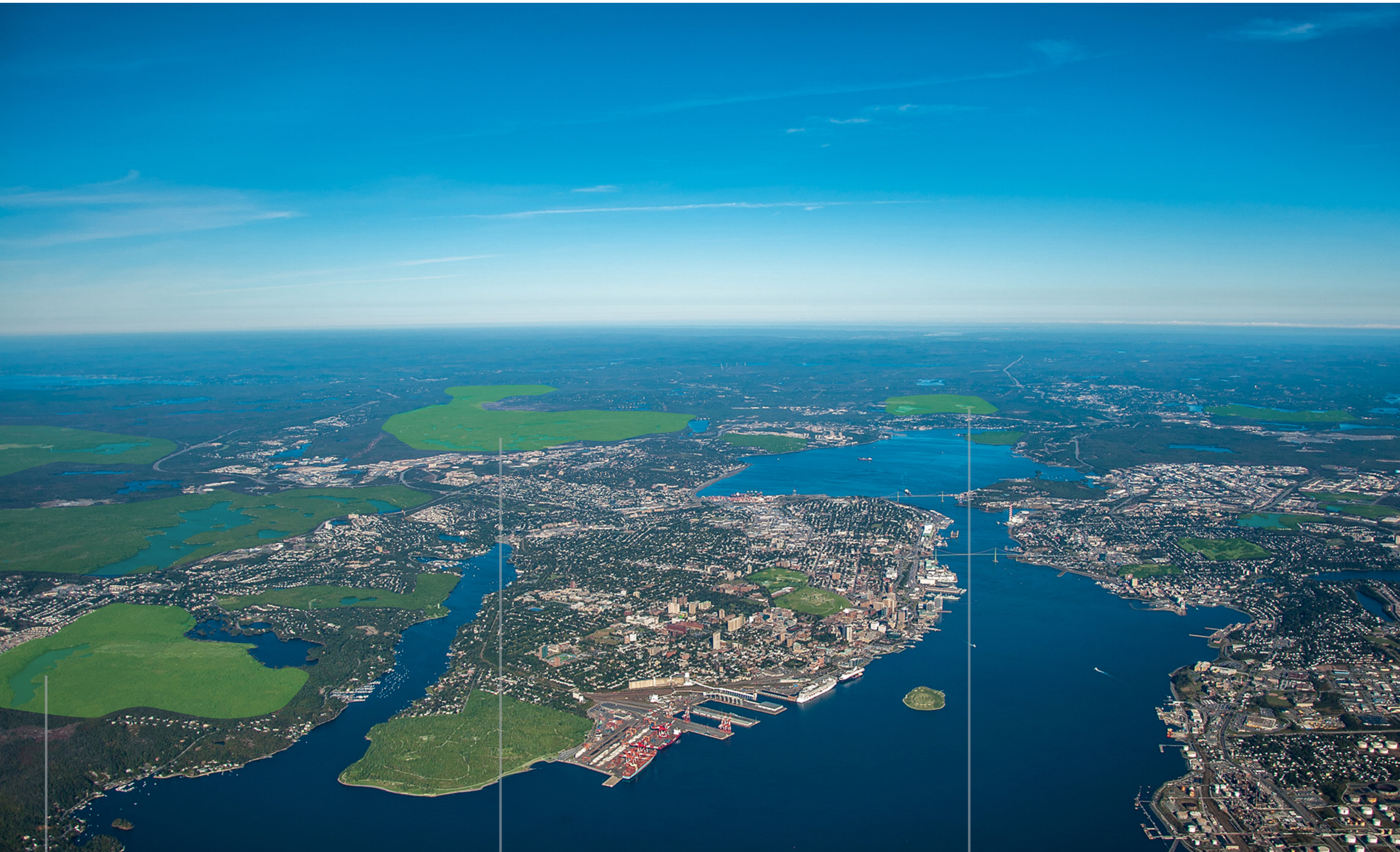
The Purcell's Cove Backlands.